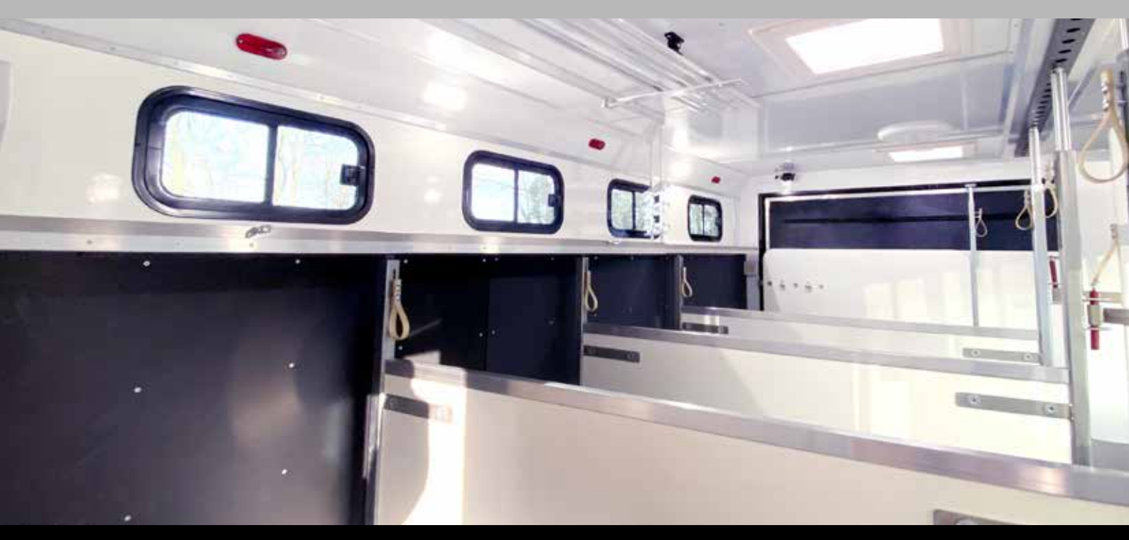
Large, clean, bright and spacious horse area