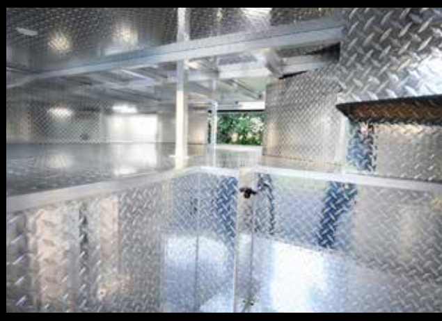
Slimline tack lockers in horse area designed to maximise space for saddles